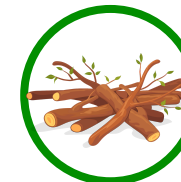
Small Logs or Branches